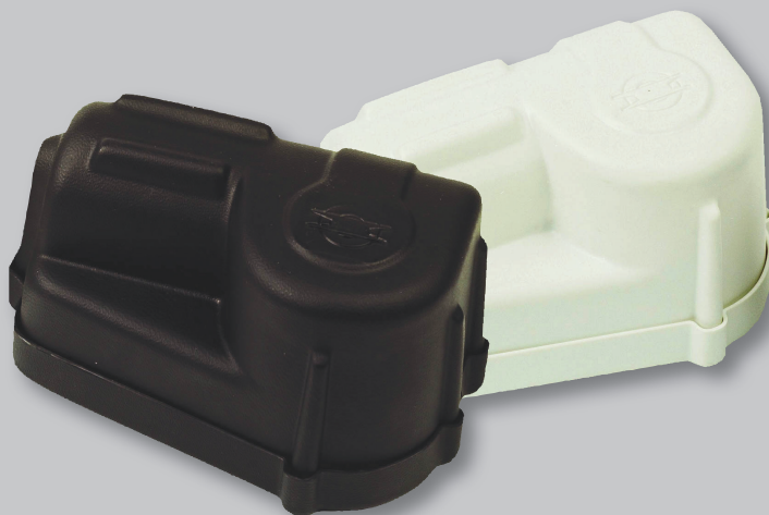
Cat. no. 2101 (white cover) • 2115 (black cover)